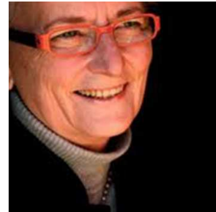
Landa Cope (USA)

President of the World Economic Congress (WEC)